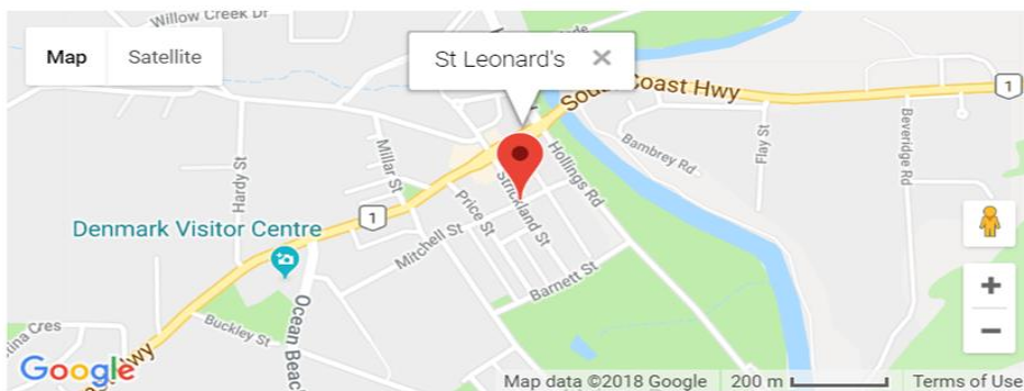
St Leonard's cnr of Strickland & Mitchell Sts, Denmark