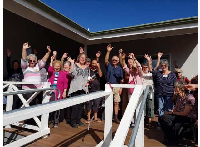
Most morning teas are held on the warm north facing deck. Opening celebrations in 2019

The lawn area is an asset and in recent times has been used for Easter celebrations, Parish gatherings under a marquee, and a story-telling yurt during the Festival of Voice. It is also a place where passers by can relax, and children can play while parents visit the op shop.