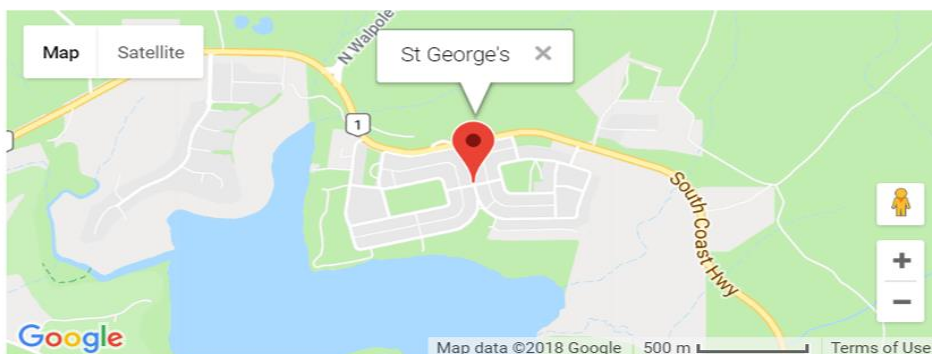
St George's 4 Vista St (cnr Pier St), Walpole