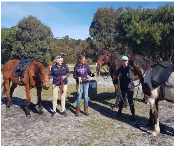
The parish has helped purchase two horses for Denmark Horsepower ~ helping people heal through contact with horses.

The close knit team of 45+ volunteers ~ more than half are from the wider community. The shop is a social hub for vologies and shoppers, and provides affordable or free goods for those in need.