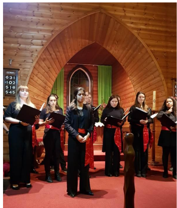
Right: St George's College Choir