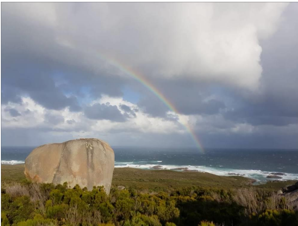
a winter's day, Tower Hill, William Bay

While we are hoping for a priest to encourage deep discernment about future directions, we are also hoping for someone to encourage us in our care for one another and enrich our faith life. As we have learnt from the growth of our Mustard Seed Op Shop, from a small but strong core, all manner of things might grow and flourish.