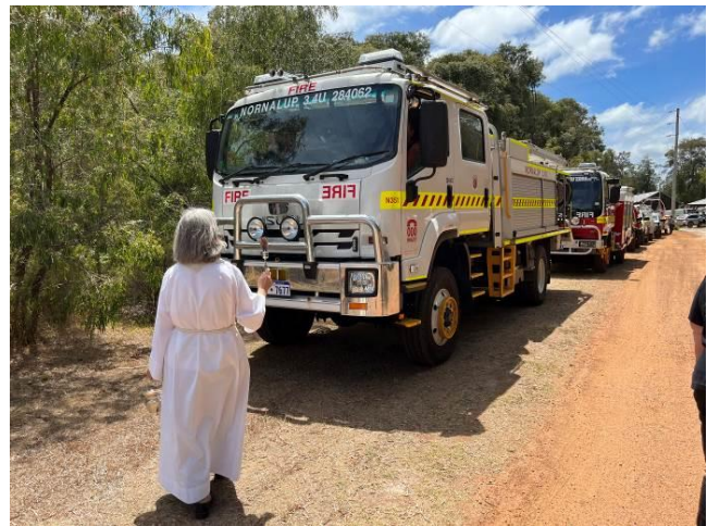
Right: Blessing of the Emergency Fleet, Walpole