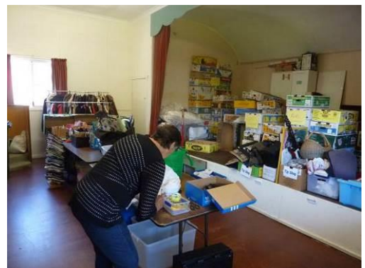
Mustard Seed sorting room in the former hall with stage. Plans to build a new shop and restore the hall are on indefinite hold.