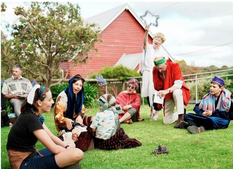
The Family Nativity is sometimes held on the lawn

The lawn area is an asset and in recent times has been used for Easter celebrations, Parish gatherings under a marquee, and a story-telling yurt during the Festival of Voice. It is also a place where passers by can relax, and children can play while parents visit the op shop.