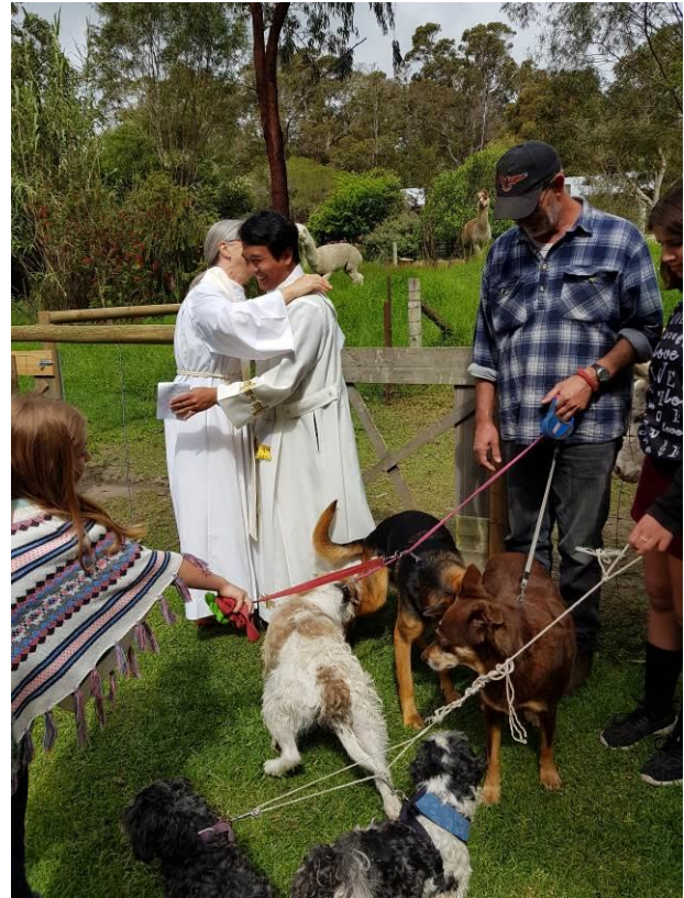
Above right: Joint Blessing of Animals with the Catholic Church